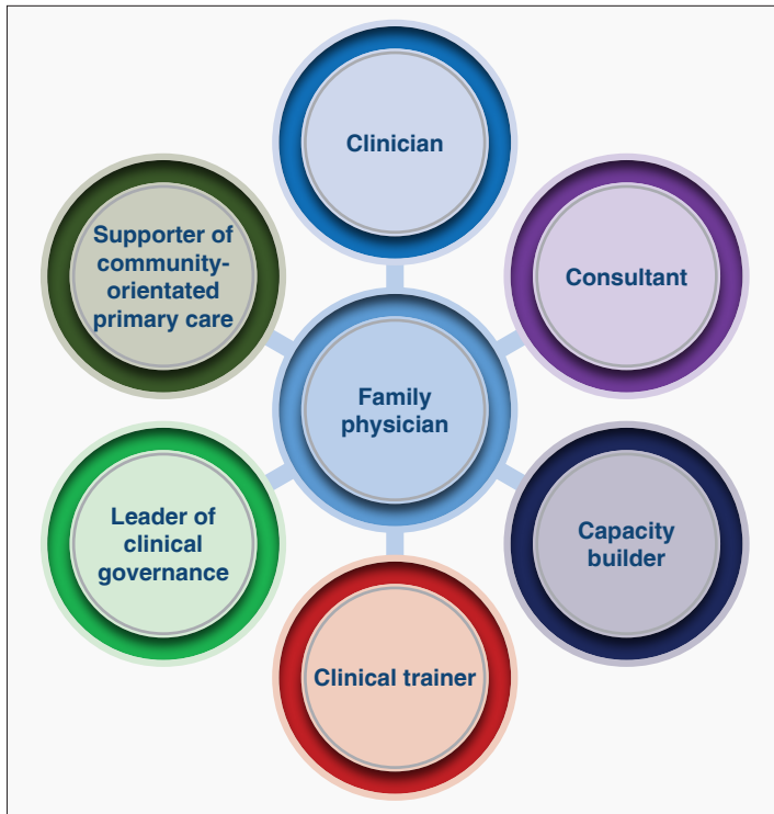
Figure 3: Six roles of the family physician.

District managers reported that family physicians improved access to a more comprehensive package of care that was closer to the community. They reduced referrals to regional and tertiary hospitals by managing more complicated patients, filling gaps in the clinical skills available as well as by improving the capability of other health care workers. Within facilities they improved the organisation of patient flow and access to care. In some provinces they supported the implementation of ward-based outreach teams. District hospitals with family physicians performed better than those without, particularly in relation to paediatric care.